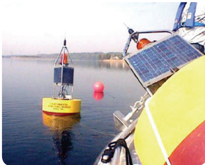
YSI Data Buoys deployed upstream of Sikorski Bridge.